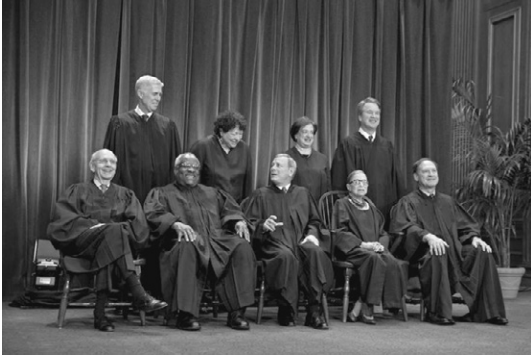
Supreme Court of the United States, 2019: Seated from left to right in the bottom row are Associate Justice Stephen Breyer, Associate Justice Clarence Thomas, Chief Justice John Roberts, Associate Justice Ruth Bader Ginsburg and Associate Justice Samuel Alito.

Law Enforcement now has a new tool in their fight against impaired drivers menacing our roads. Arresting and prosecuting impaired and intoxicated drivers after a crash has a new tool that gives the ability to speed up the testing of unconscious drivers expected of alcohol-related impaired or intoxicated driving.